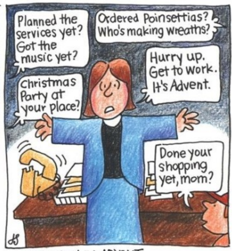
ONE MONDAY IN ADVENT