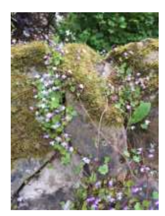
The Editor wonders, "Keith, do you know?" By the way, the pictures are much better on line so check Spirit out on St. Peter's website.

Habitat for Humanity is Building in Campbell River and they Need Your Help! Habitat for Humanity Vancouver Island North is building in Campbell River at 477 Hilchey Road. By the end of this year, they plan to build one duplex (two homes) for occupancy and a second duplex to lock-up. This is the second phase of a project that will see eleven homes consisting of four duplexes and one triplex on the site. In 2017, Habitat built the first duplex, which two families purchased and moved into last October.